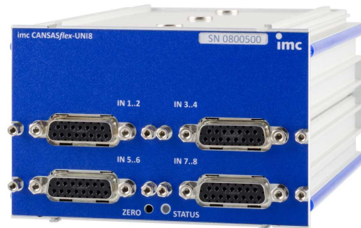
imc CANSASflex-DCB8 (Fig. similar)

For the supply of external sensors and bridge measurement a sensor supply with adjustable voltages 2.5 V to 24 V is included.