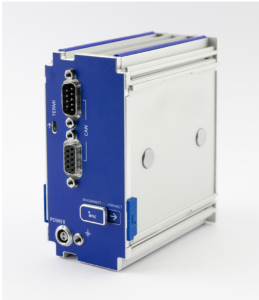
protective cover left (labeled with "L")