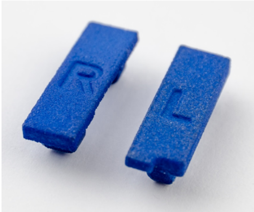
set consisting of left and right protective cover