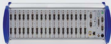
imc SPARTAN-8 with 2 CAN nodes and standard equipment of pulse counter and digital I/O