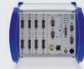
imc SPARTAN-1 with 2 CAN nodes and standard equipment of pulse counter and digital I/O