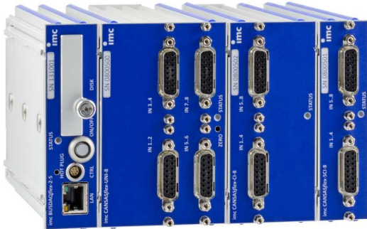
imc CANSASflex modules connected (Click-mechanism) in a block with imc BUSDAQflex Logger (left)