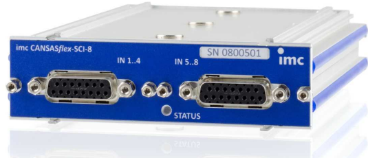
imc CANSASflex-DO16 (Fig. similar)

As a CAN-bus-based measurement engineering tool, the imc CANSASflex series offers a wide selection of measurement modules which process and digitize sensor signals and output these as CAN-messages.