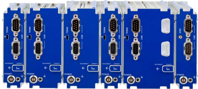
rear view of this block: CAN, Power supply, Terminator, Locking slider