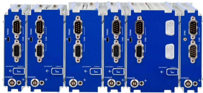
rear view of this block: CAN, Power supply, Terminator, Locking slider