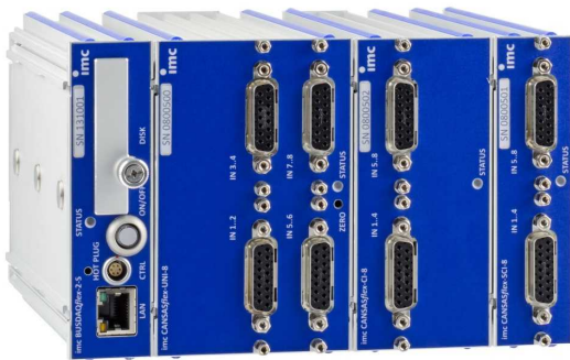
imc CANSAS flex modules connected (Click-mechanism) in a block with imc BUSDAQ flex Logger (left)