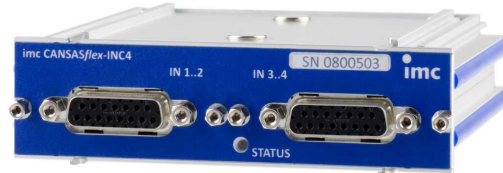
imc CANSASflex-C8 (Fig. similar)

The module is available in both short and long housing.