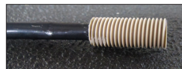
Peek Tip Threaded