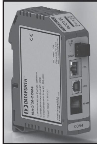
Figure 2: Communications Module