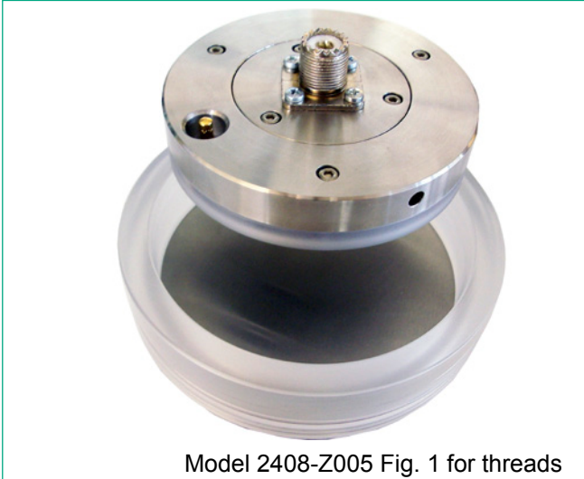
Model 2408-Z005 Fig. 1 for threads